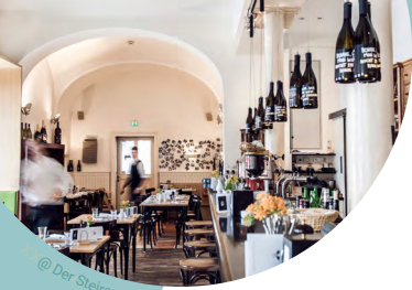
@ Der Steirer