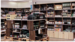
@ 's Fachl