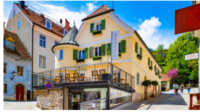
@ Werner Knig