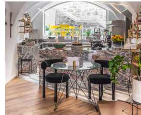
@ Helmut Marko Hotels

40 Erzherzog-Johann-Allee 3 > salaettl.com