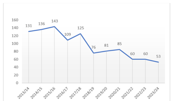
Fig. 1: Number of first semester students in Electrical Engineering over the last ten years.

Against this backdrop, Europe is facing an already chronic shortage of microelectronics workers with skills gaps being one of the biggest challenges that undermine the growth potential of not only the semiconductor industry, but the European economy as a whole. In the most recent report of European Labour Authority, STEM profiles were identified as profiles of high magnitude shortages [7]. Likewise, nearly 1.1 million job advertisements for electrical- and electronic engineers were placed in the EU between mid-2018 and the end of 2019 (CEDEFOP, 2020). A university of technology in Austria reports a 60% drop in student inflow in electrical engineering over the last 10 years (see Fig. 1) Similar patterns exist in other universities across Europe.