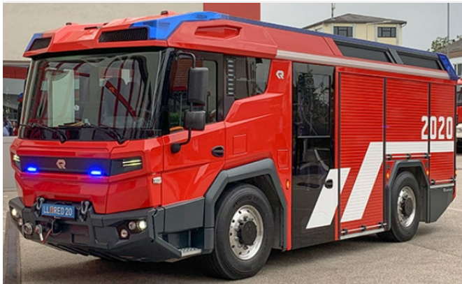
Wheel suspension (front and rear axis with identical suspension)