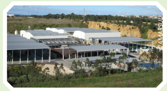
AMARSUL, Municipal Solid Waste Processing Plant