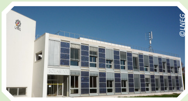
National Laboratory of Energy and Geology (LNEG)